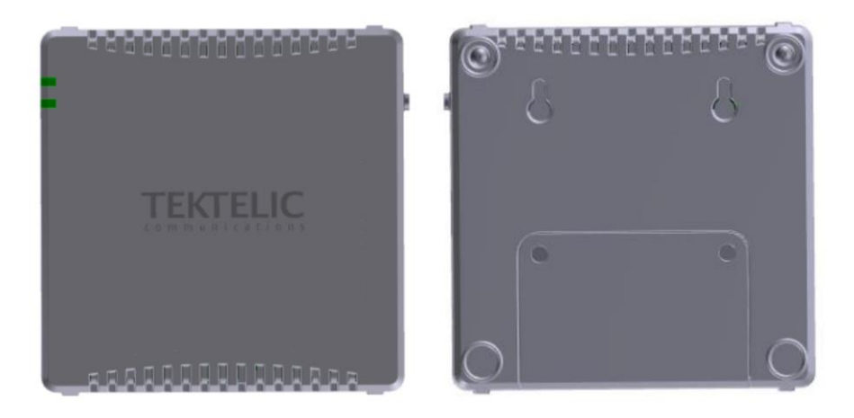
Figure 2. Module Wall Mounting Orientation

While wall mounted, the Gateway module must be oriented with the TEKTELIC logo horizontal, parallel to the earth as shown in Figure 2.